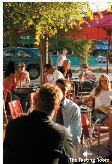
The Tasting Room

Wining, dining and wildlife Shortly before sunset, take the 10-minute trip to the Zealandia wildlife sanctuary for a night-time tour. You might be lucky enough to spot native kiwi foraging on the forest floor, tuatara hunting for food, or glowworms shining. Return to Wellington for dinner at one of the city's hot spots.